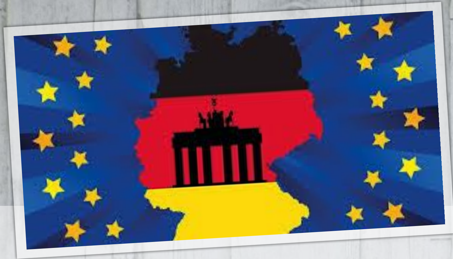
Host country culture

Slightly dominant of cultural orientation